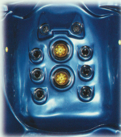
Deep bucket seating with multi jet combinations

Three standard waterfall features included