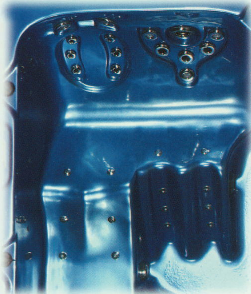
Double lounger with separate leg and foot jets

Surround yourself with a multitude of therapy options. Every seat is uniquely designed with strategically placed jets to provide a full body massage experience.